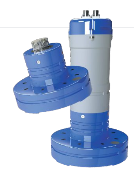
» The highly versatile Pinnacle 45 can be used for real-time applications, moving boat applications, or self-contained applications.

system configuration for real-time or selfcontained applications, independent or interlaced long-range and high-resolution modes, as well as many other innovative new features and product enhancements.