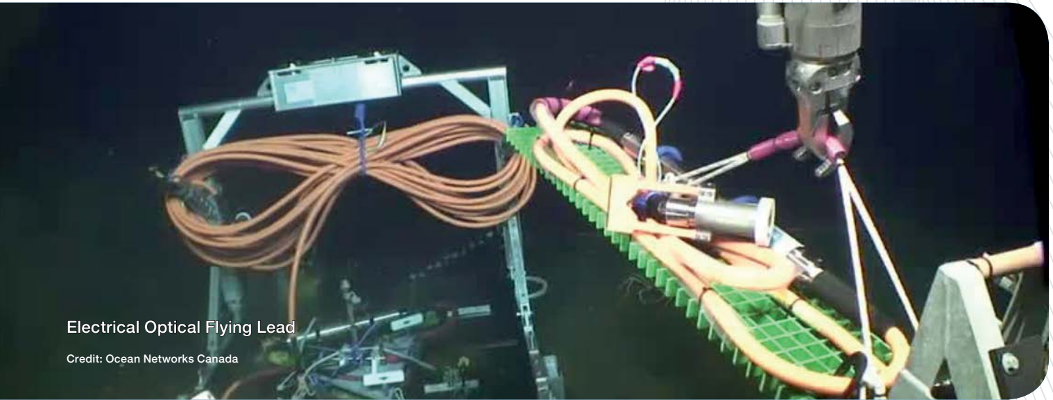
Electrical Optical Flying Lead