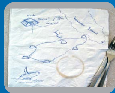
Initial NEPTUNE concept — napkin drawing by scientists over dinner