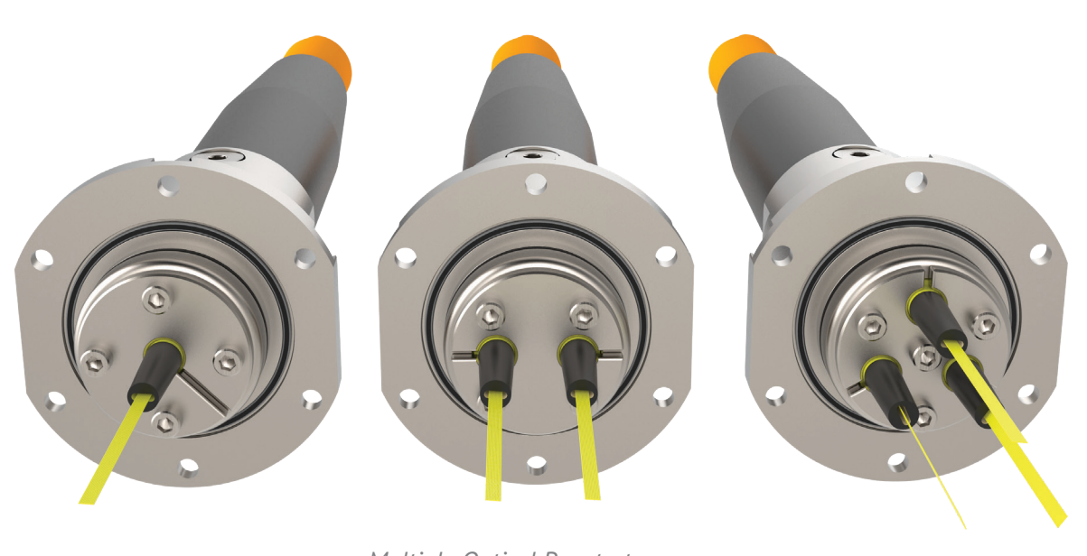
Multiple Optical Penetrators installed into bulkhead flanges